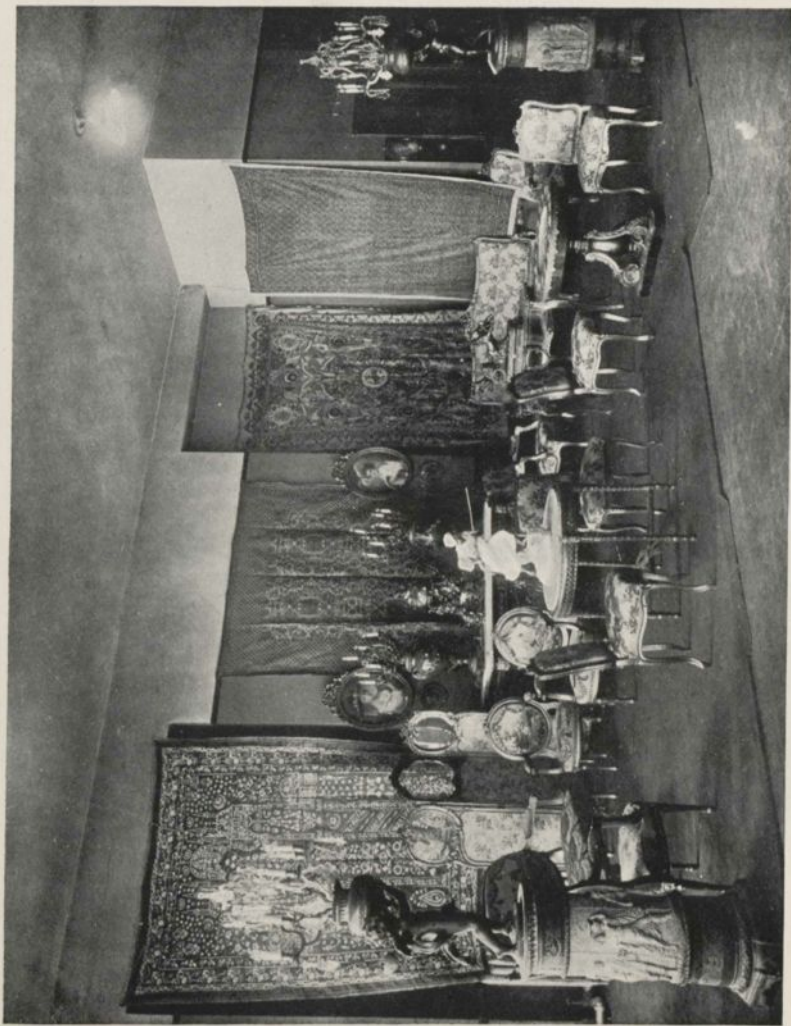
SOME IMPORTANT OBJECTS IN THE COLLECTION